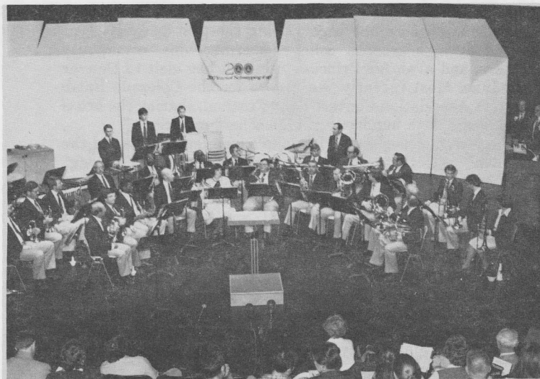
The Wilson Community British Brass Band poses for their picture just after they finished playing for the judges.