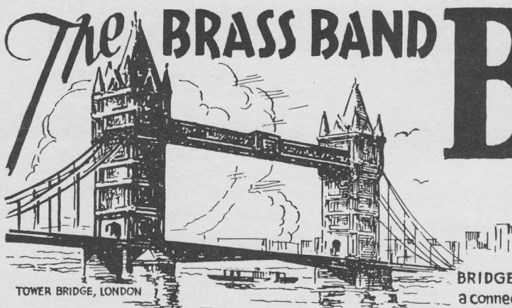
TOWER BRIDGE, LONDON

BRIDGE: a link, a tie, a bond, an alliance, a connection, to band together, to unify.